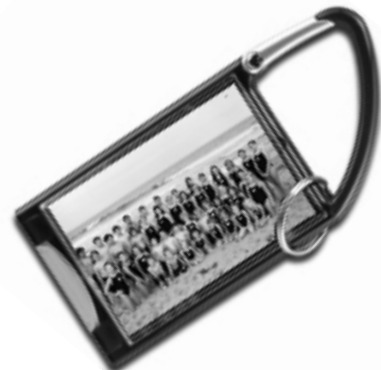
Carbineer key chain that holds two small photos: individual on one side and team on the other.